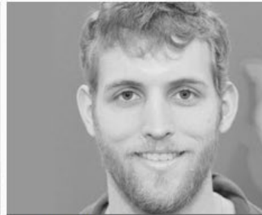
Gregory Kick Google