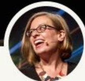
Lara Hogan Front-End Performance